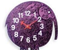
Elihu the Elephant 320 x 320 x 50 mm 12 1/2 x 12 1/2 x 2"