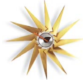
Turbine Clock Ø 765 mm / 30"