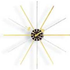
Star Clock Ø 610 mm / 24"