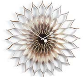
Sunflower Clock Ø 750 mm / 29 1/2"