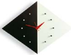
Kite Clock 410 x 550 mm / 16 x 21 1/2"