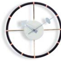
Steering Wheel Clock Ø 305 mm / 12"