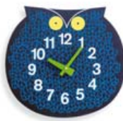
Omar the Owl 255 x 270 x 35 mm 10 x 10 1/2 x 1 1/4"