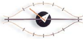
Eye Clock 340 x 760 mm / 13 1/2 x 30"