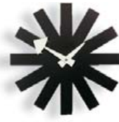
Asterisk Clock Ø 250 mm / 9 3/4"