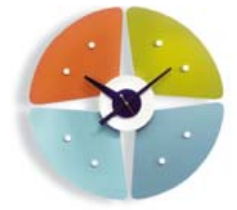
Petal Clock Ø 448 mm / 17 1/2"