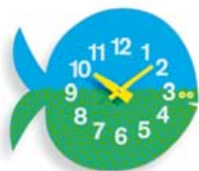
Fernando the Fish 250 x 280 x 35 mm 10 x 11 x 1 1/4"