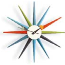
Sunburst Clock Ø 470 mm / 18 1/2"

As a truly multi-talented designer, George Nelson was also successful as a graphic designer. His Zoo Timers – strongly colourful personalities from the animal kingdom – contrast sharply with his sculptural wall clocks from the 1950s thanks to their graphic touch. The Zoo Timers offer children a playful and enjoyable approach to telling the time.