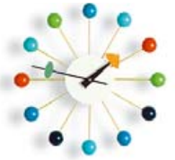
Ball Clock Ø 330 mm / 13"