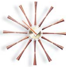
Spindle Clock Ø 577 mm / 22 3/4"