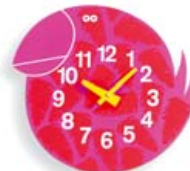
Talulah the Toucan 260 x 290 x 35 mm 10 1/4 x 11 1/2 x 1 1/4"