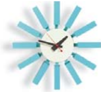
Block Clock Ø 290 mm / 11 1/2"